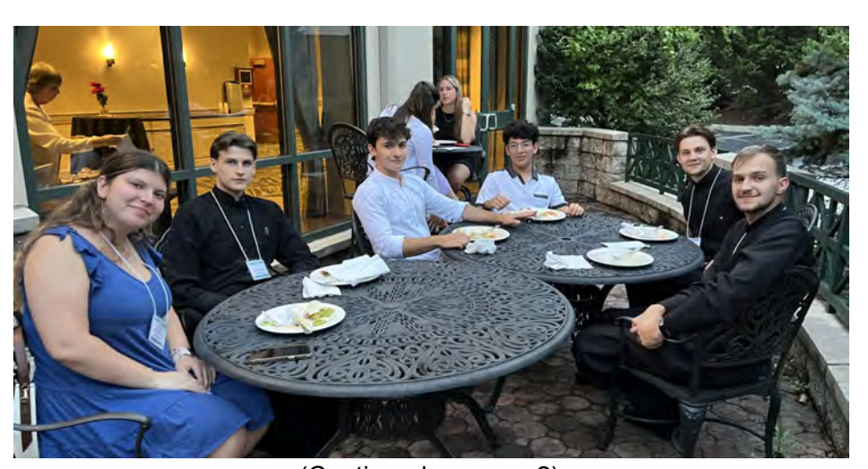
(Continued on page 2)

Following the choir rehearsal members gathered for a delicious meal of fish tacos and wonderful Philadelphia treats. Our meeting rooms were set with tables so that we could mingle and catch up with old friends and make new ones.