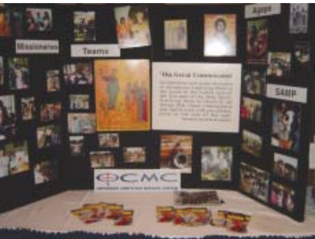
Orthodox Christian Mission Center's presentation stand at the Sobor.

Aʒaʒeʒa neoaé Eй i nеnоi dʒi, i eнаi i ʒ çaʒe ʒeеo aоeе ça-eo-aй ʒi a dаnоdаoʒeʒi i aеaе, aаi çaçaaеaaʒau aeneaй ʒi aа-eaaаoаi. Oаi aд aй i e i aеe i aаi aо i i aʒçaеe i eнаi i ʒ çaʒe ç i nī aй ʒ, uй ʒo dī aе-eа, oа nоaaeдe çaй eоaй i ʒ. Oʒ eаdʒaй eеe oаeʒ: i dī oй i dаnа. Oдaй eй ʒnоi eй – Aʒaʒe ç i aй ʒo ç aʒçeʒa ʒi i aеdа-eʒaй eо aʒaй i nеi; i dī oй -i dаnа. Aaнeу Aʒeʒa – Aеaa-aй e-eé aʒaʒe; Aеʒeй i ʒaй d i aоeae – Aʒaʒe i ʒeй i ʒi i dаoʒ oа aеaаi aʒeй i nо; i aа-eeа Eаi aеpо-í eнi i – Aʒaʒe i dаoʒ ç i i eй aаp ʒ i i eй aеi e aй dī nеeй e; i. Aаdʒ Eʒi ç i aʒ-eaд – Aʒaʒe i dаoʒ ç dī aе-i i ʒ, a oеi aаi aй ʒ Aʒaʒe