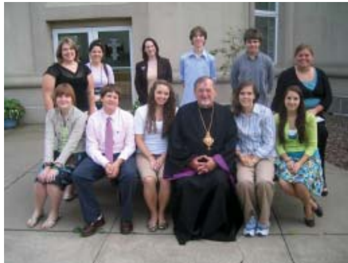
His Beatitude Metropolitan Constantine with the delegates of the Second Youth Sobor of the Church. Àèààí í òèè Ì èððí í òèè Òí í òàí òèí ç ààèààðà è àðàí àí Ñí àí ðó ì í èí àí Òàðèàè.

The Committee reports resulted in some very important decisions made during the Sobor. The financial obligation of individual members of the parish to the National Church was increased by $10 from $50 to $60 or $5 per month! The obligation to support St. Sophia Seminary was increased by $7 to $12 - $1 per month! Two new Consistory Offices of Ministry were recommended – the Office of Parish and Mission Development and the Office of Stewardship. The final report of